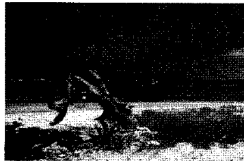
St. Vincent & The Grenadines Feb. 5 th – 20 th 2011