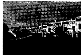
PORTUGAL LONG STAY Stay three, four or six weeks From Feb. 22 nd 2011

Contact Meikle Turner 613-542-7744 or Nadene Strange 613-542-5796 for any tour folio. Please do not delay if you are interested. Air space and accommodation become increasingly difficult to secure as time goes by.